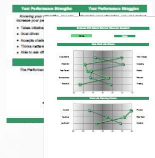
DNA Ultimate Performance Card