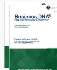
Business DNA Natural Behavior Report