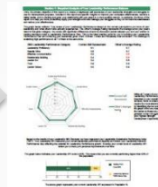
DNA Leadership Performance Plan