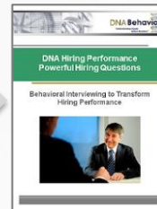
Powerful Questions for Hiring Book